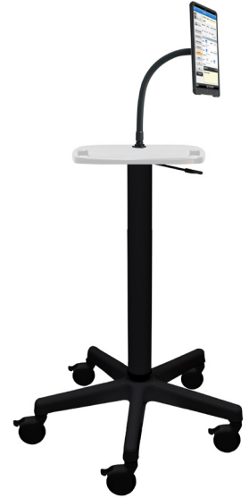
Mov-it Tablet Cart - C4 T30431-012