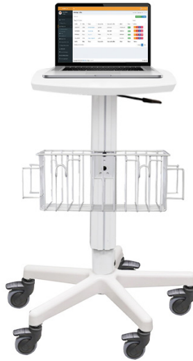
Mov-it Magneflex iPad Cart - C3 T30431-014