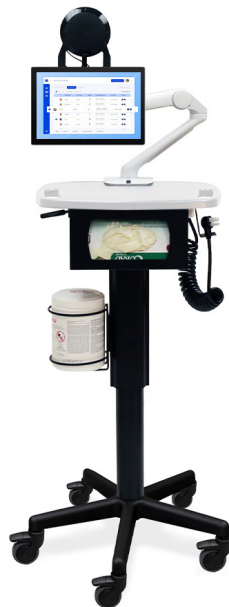
Mov-it Tablet Cart w/ Storage - C6 T10336-023