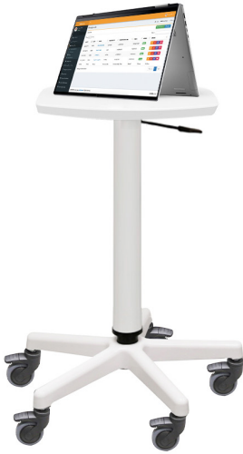
Mov-it Tablet Cart: Standard w/Storage - C2 T10530-022