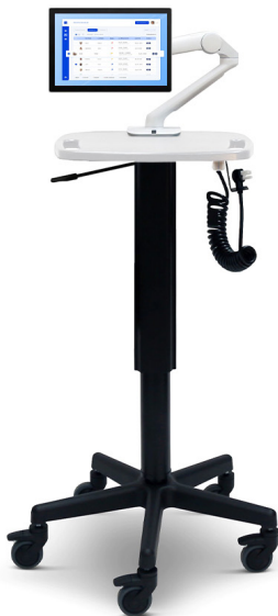
Mov-it Telehealth Tablet Cart - C5 T30431-013